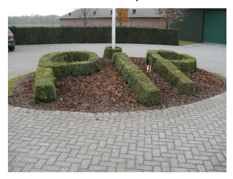
At right is an aerial view of the PIP Circle

The below is the circle entranceway of the farm.