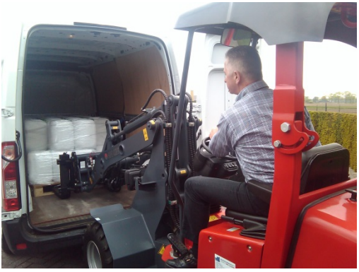
Above, you can see the shape of the Chrisal 20 liter totes of PIP products being unloaded during a delivery to the farm